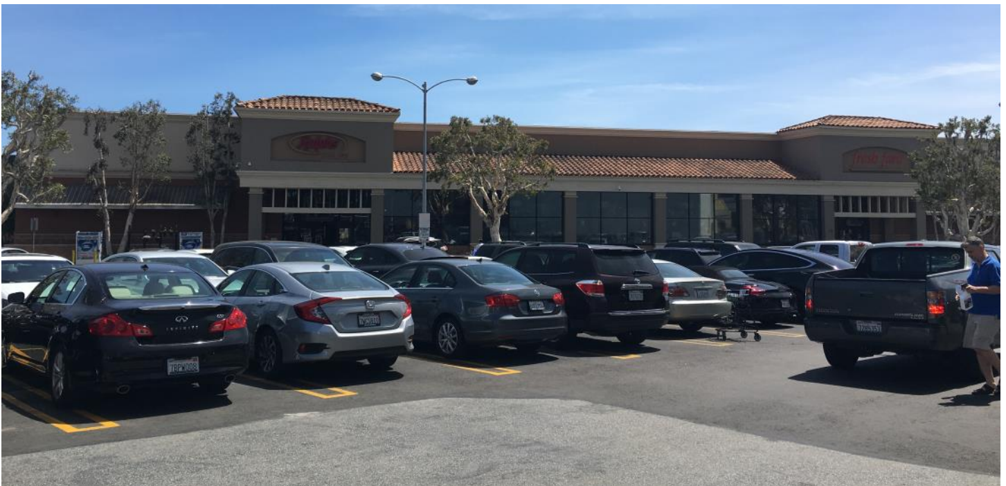
View of Ralphs Fresh Fare from the parking area