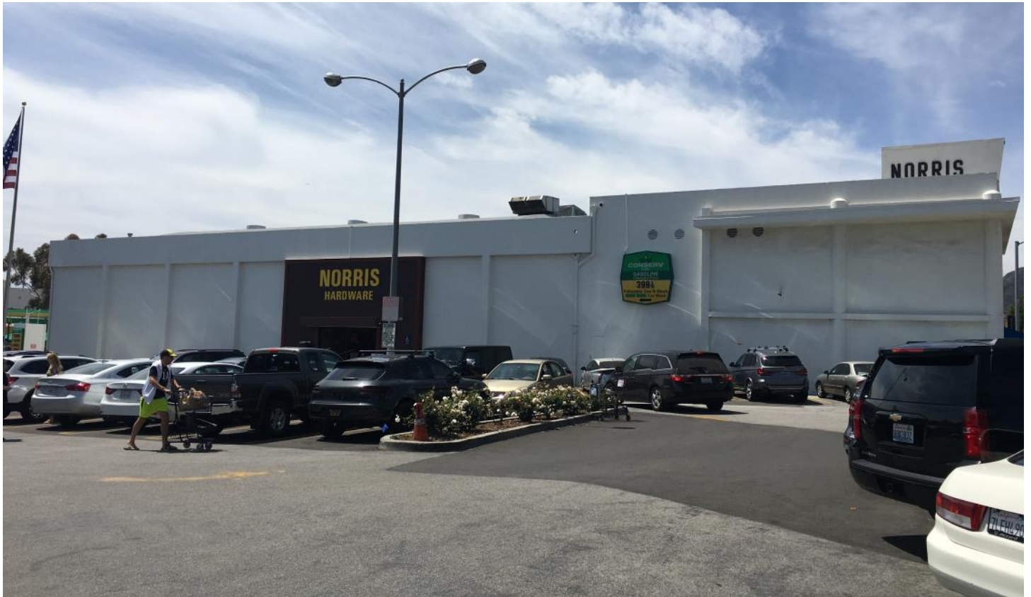
View of the available premises from the parking area