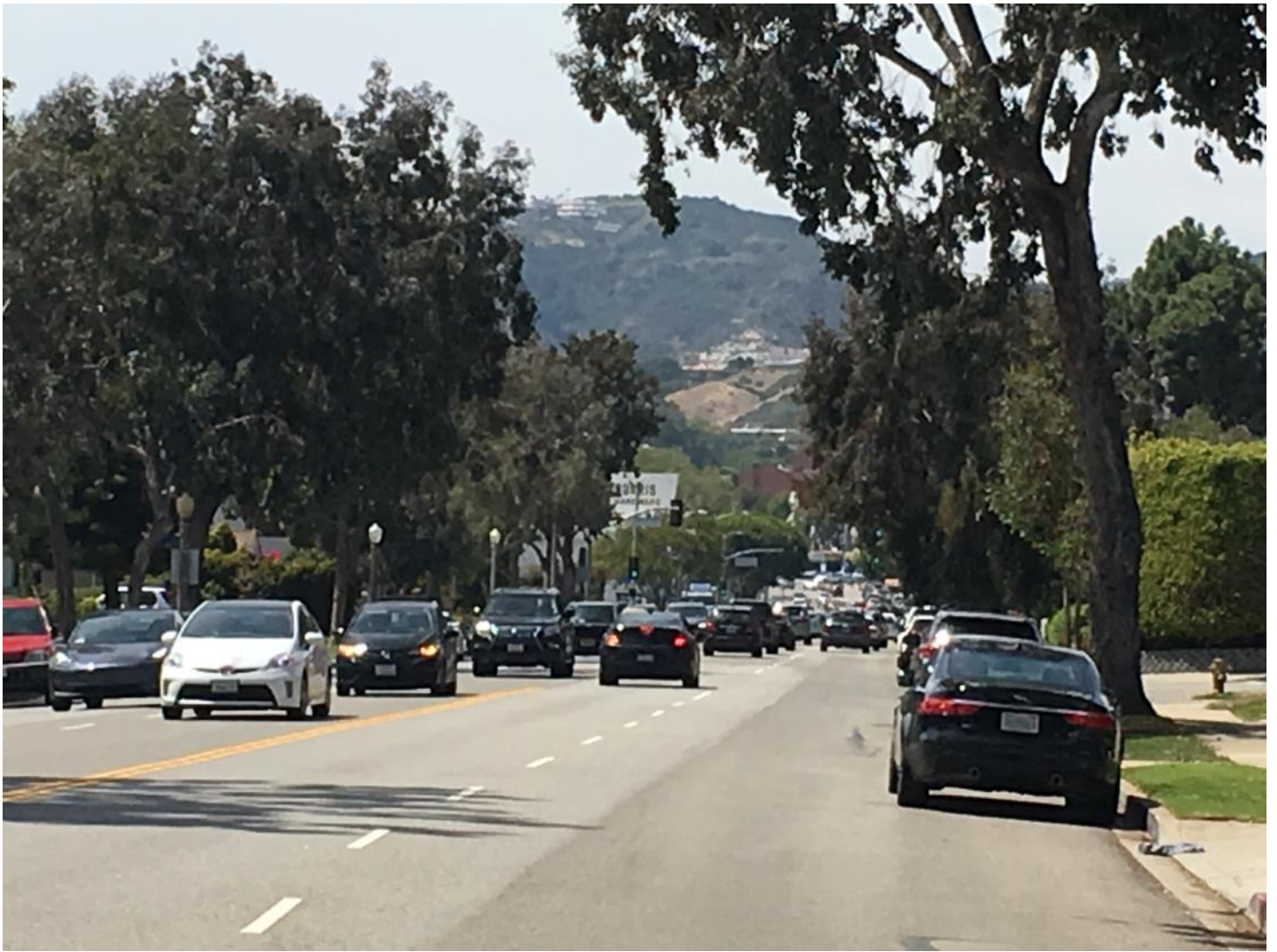
View of the premises rooftop signage from 1/4 mile East of the property